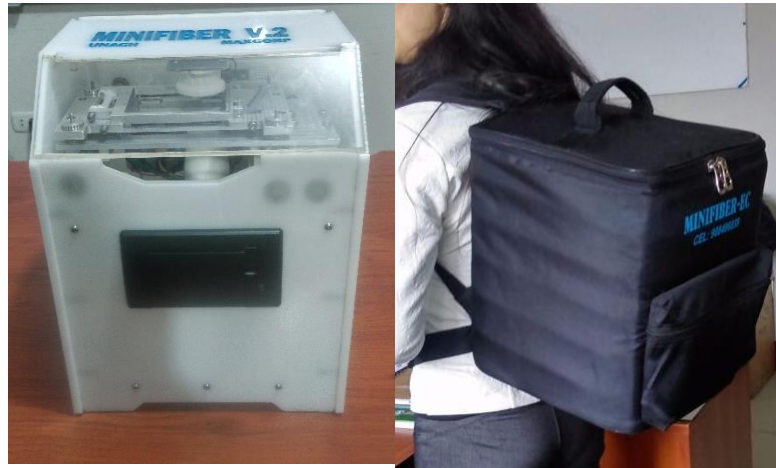
Figure 1. Portable Fiber Tester working at farm condition. The image of left side (Figure 1a) show the small dimensions. The image of right side show the portability

SDAFD, number of measures, temperature, environmental humidity and other information) are saved in an Excel file (Figure 1a).